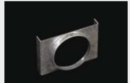
Pipe Flange (EFPF)