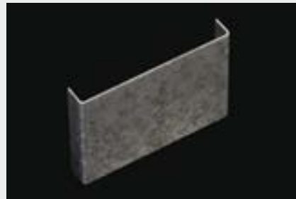
Blank End (EFBE)